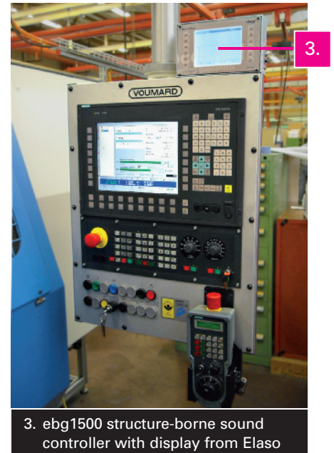
3. ebg1500 structure-borne sound controller with display from Elaso

Elaso adapted the ebg1500 structure-borne sound control system for refitting existing Voumard 300 CNC internal grinding machines. The unit is installed at a well known grinding company and is used extensively. Adding the structure-borne sound system does not involve any change in machine controls or software and is therefore very convenient for the after market fitting. Installation is straight forward and can be accomplished within a day. Advantages using the ebg1500: